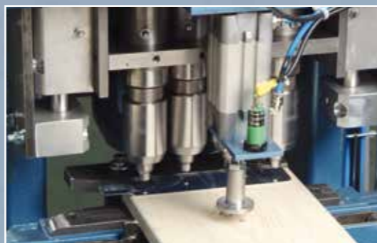
7. Hydraulic radial technology hinges press.