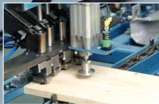
2. Drill and rivert montage.