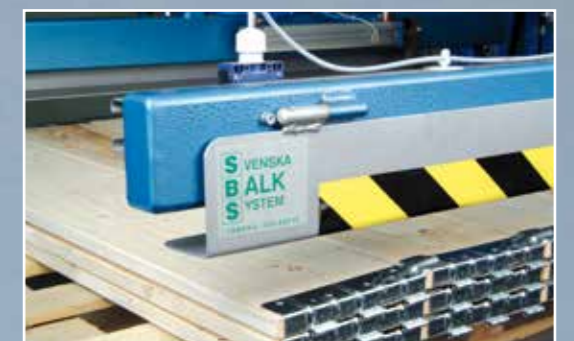
10. Stacking on pallet.