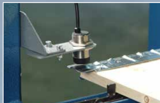
6. Sensor for hinges control.