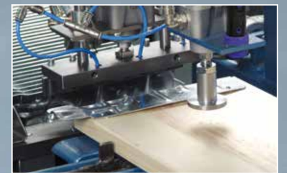
5. Hinges montage and store for 70 hinges.