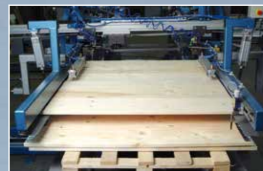
9. Drop system on pallet.