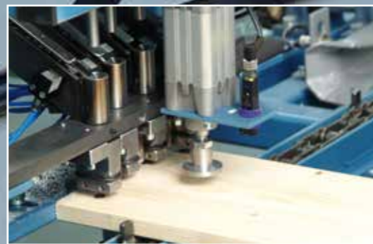
2. Drill and rivert montage.