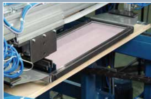
8. Screen printer.