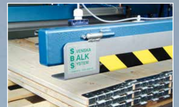
10. Stacking on pallet.