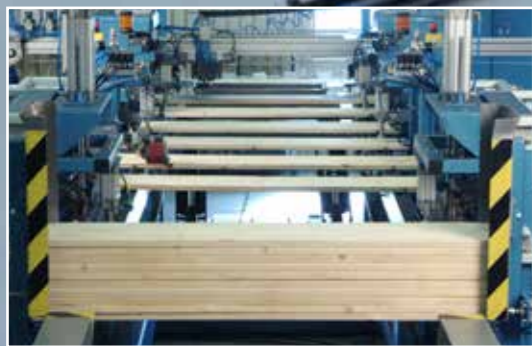
1. Store for 25 boards.

SBS2400 produced of component with very high quality. The machine is build up on a strong frame. It is module built which means the different moment of the production can be chosen. As option auto picking from pallet with 5 remnants and automatic pallet charging, cutting off equipment can be received. SBS 2400 has as standard ID-print equipment in the line. Further, for example logo or similar are screen printed on the material. You can choose different colours on the print. The machine is sure in operation and very fast. In 6 seconds SBS 2400 drills, riverts montage, turns, hinges montage, print, stacking one parts of a pallet-collar on a lift table with pallet.